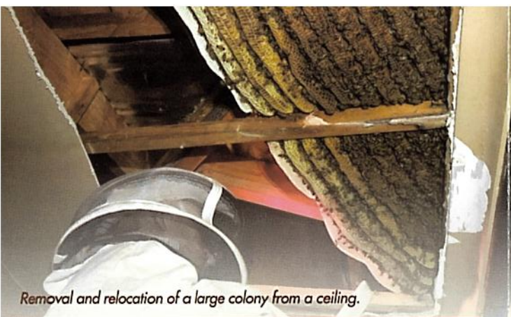
Removal and relocation of a large colony from a ceiling.

WHY DO I HAVE TO PAY TO HAVE BEES REMOVED? The removal of a colony of honey bees may be compared to any other professional home visited service, such as a plumber, electrician, building contractor etc. and will carry a professional service fee.