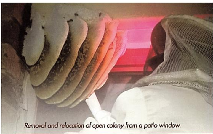
Removal and relocation of open colony from a patio window.

ONE OFTEN HEARS , "WELL, I WILL JUST SPRAY AND KILL THEM"! We highly recommend that you do not attempt your own "bee removal" due to the danger and complexity of the process. An attack by African honey bees could be fatal.